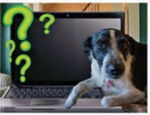
Centre of Pendeen Facebook page

loes your laptop or tablet make you feel like you are banking up the wrong ne when it comes to IT skills? If you are strugging with something omputer related why not pop in to one of our free strop-in computer help eactors at the Centre every Monday in September from 1.30-3.30 . Iverybody welcome.