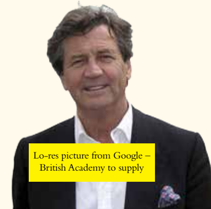
Lo-res picture from Google – British Academy to supply

Combining a booklet, a series of video interviews, a multimedia website and a special edition of the British Academy Review , it shows the Academy's disciplines 'at work', and the role that high level expertise plays in fostering a flourishing society and tackling its multiple challenges. The project was launched with a reception at the House of Lords followed by an evening public panel discussion chaired by Melvyn Bragg.